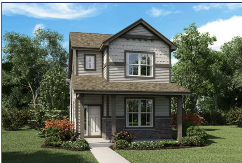
Elevation A - Craftsman

3 Beds • 2.5 Baths • 2 Garage Bays • 1,742 fsf