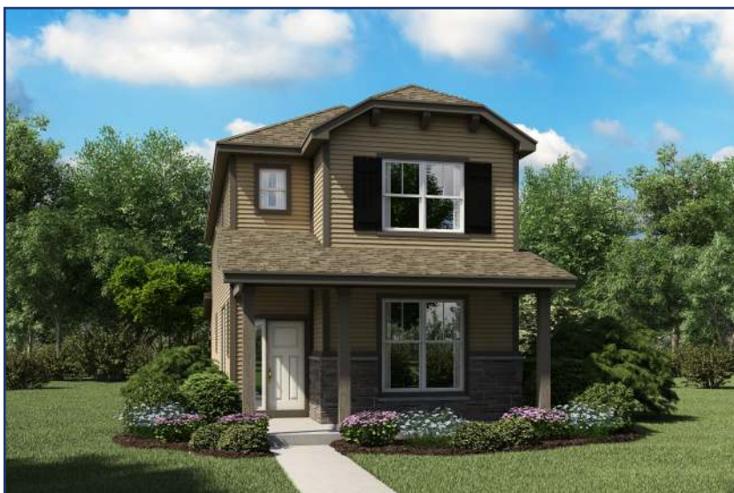
Elevation B - Cottage