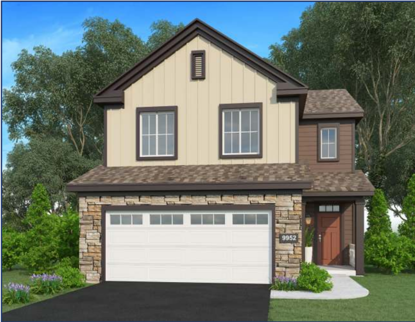
Elevation A - Farmhouse

3 Beds • 2.5 Baths • 2 Garage Bays • 1,777 fsf