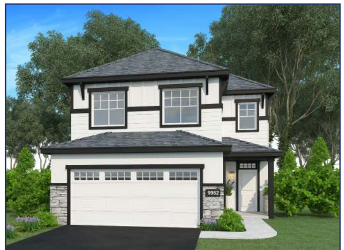
Elevation C - Prairie

Ask your Sales Consultant to see more exterior color options!