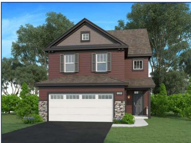
Elevation B - Craftsman

Extended Patio/Covered Patio Gas Fireplace Tray Vault in Primary Bedroom Barn Door at Primary Bath Primary Bath Shower with Tile Surround Laundry Cabinet and Sink Stone Accents Across Front of Home