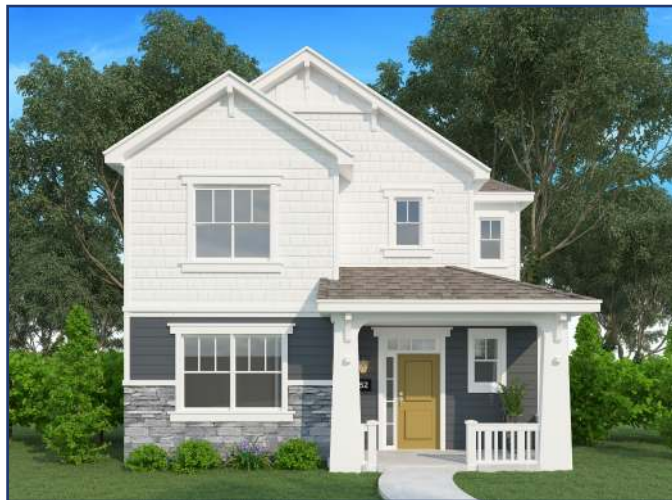
Elevation B - Craftsman