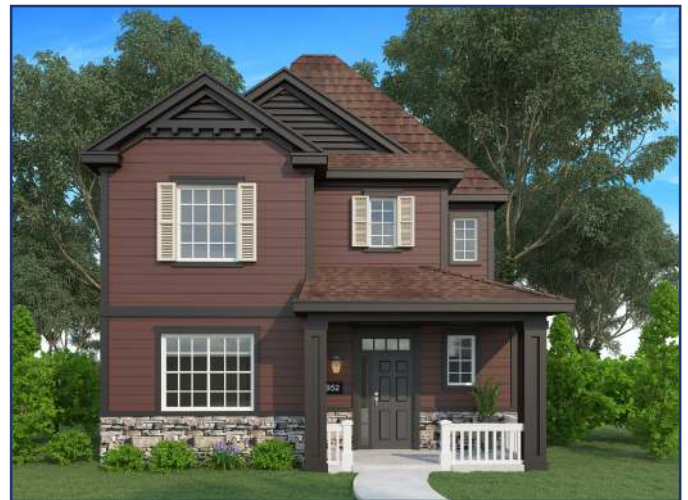
Elevation C - Colonial

FEATURES: Island Kitchen and Pantry Primary Suite with Large Walk-in Closet Loft