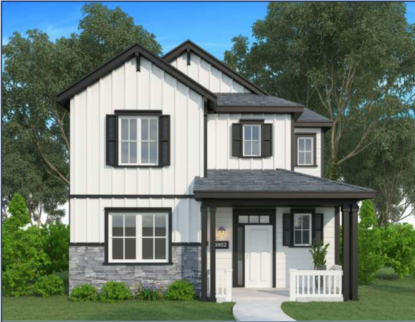
Elevation A - Farmhouse

3 Beds • 2.5 Baths • 2 Garage Bays • 1,769 fsf